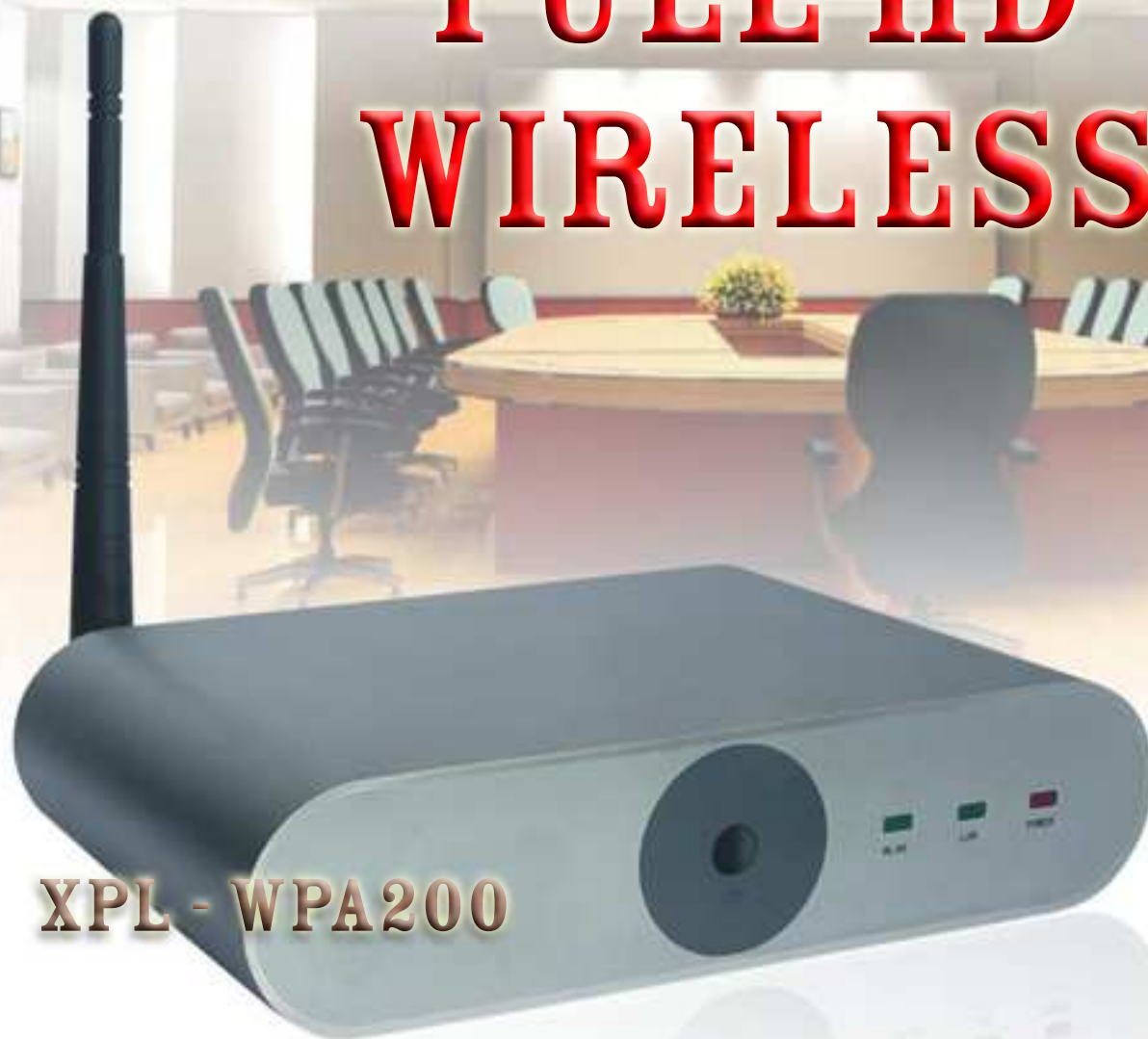
XPL - WPA200